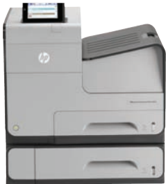
HP Officejet Enterprise Color X555xh