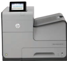
HP Officejet Enterprise Color X555dn

A printing revolution for your enterprise. Produce color documents at up to twice the speed and half the cost per page of color lasers. 1,2 Designed with advanced security and full manageability, this enterprise printer is built to last.